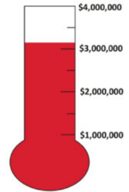
For Every Child Campaign