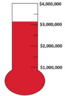
For Every Child Campaign