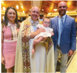
Congrats to the Porter family on the Baptism of their baby girl!

Let's come together and help St. Vincent de Paul as they house, feed and support those in need with compassion and dignity! Scan the QR Code for more information!