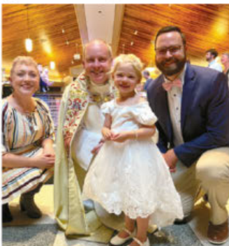
Congrats to the Monsma family the Baptism of their precious daughter!