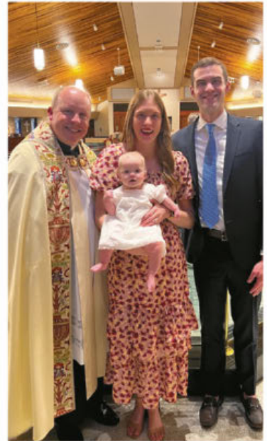
Congratulations to the Simpson family on the Baptism of their beautiful baby girl!